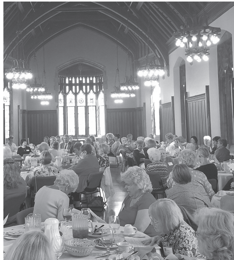
Guild members gather for the September luncheon.