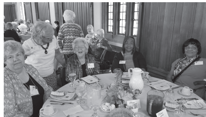
Guild members enjoying their time at the September luncheon.

For questions about our projects, please call 314-892-0888.