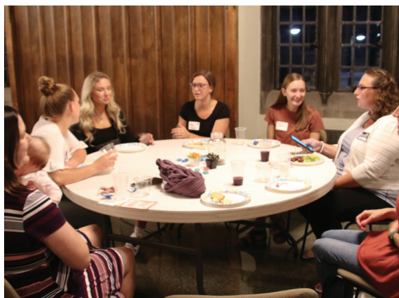
Members of the Seminary Women's Association gather for a wine and cheese night Aug. 30, 2022, in Koburg Hall.