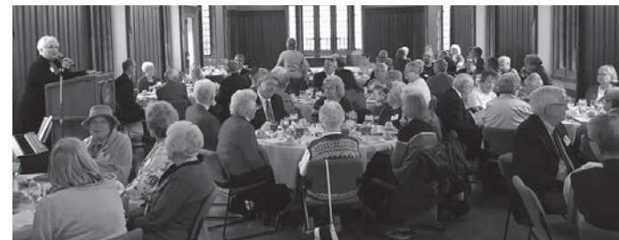
The luncheon was held in Koburg Hall.