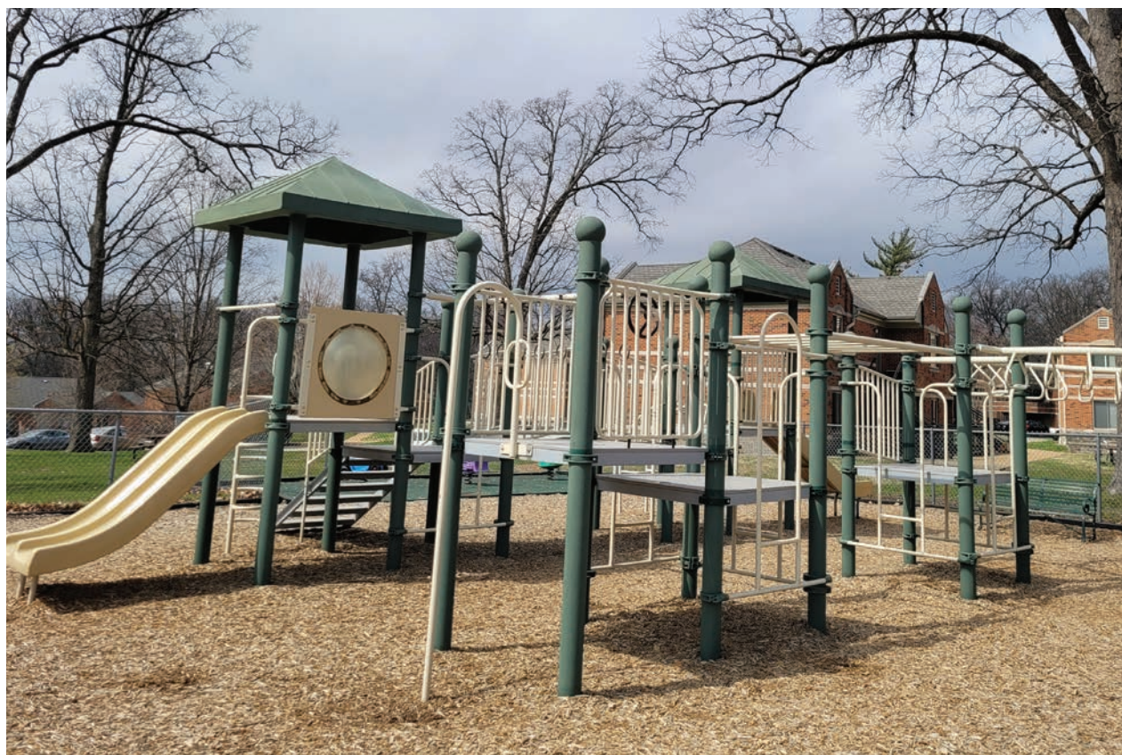
The refreshed play structure near the Woods married student apartments.