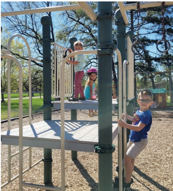
Children play on the updated playground located in the Woods.